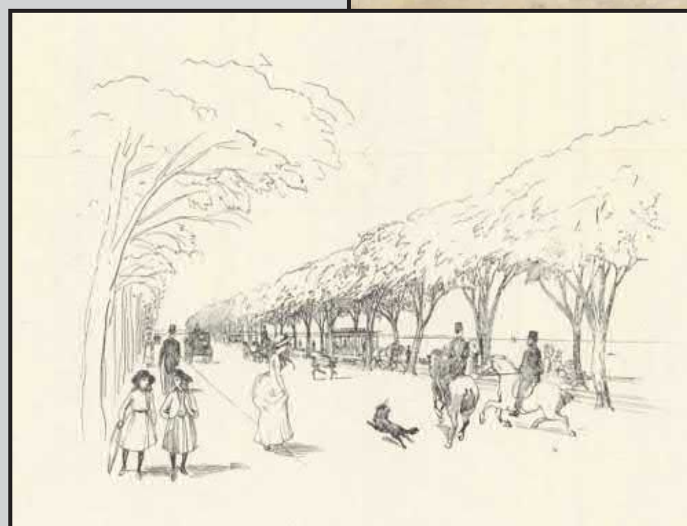
South Park Sketch, Buffalo NY circa 1887 - 1895