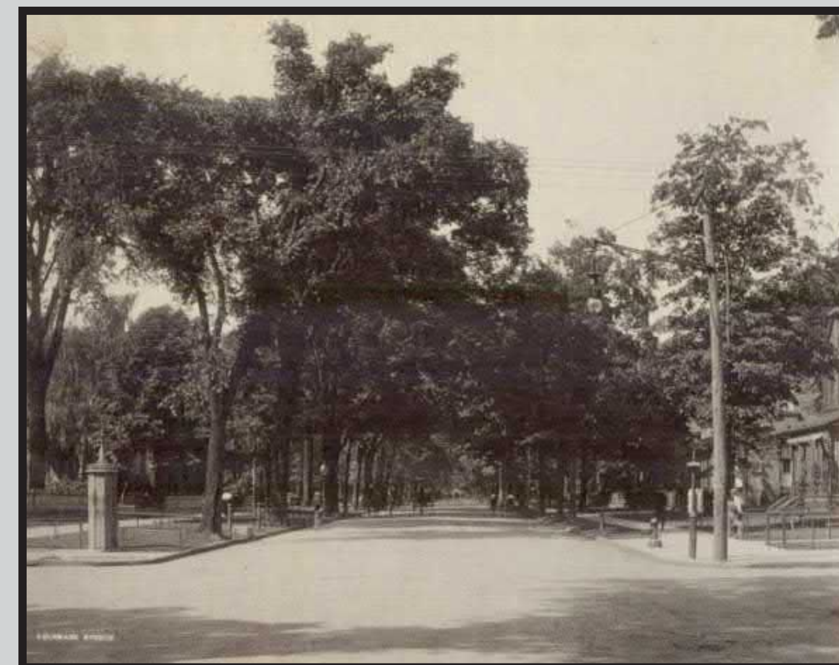
North Street, Buffalo NY