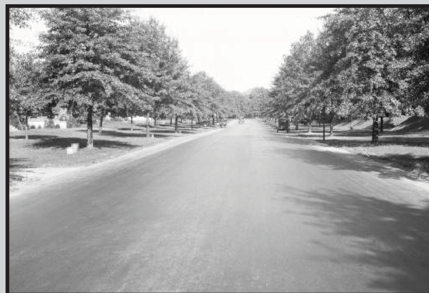
Eastern Parkway, Louisville, 1926 looking east toward Barret Av.

A pleasant experience for 'Park Way' users was a high priority for the firm, therefore canopy trees plantings were carefully placed throughout, adding to the scenic character.