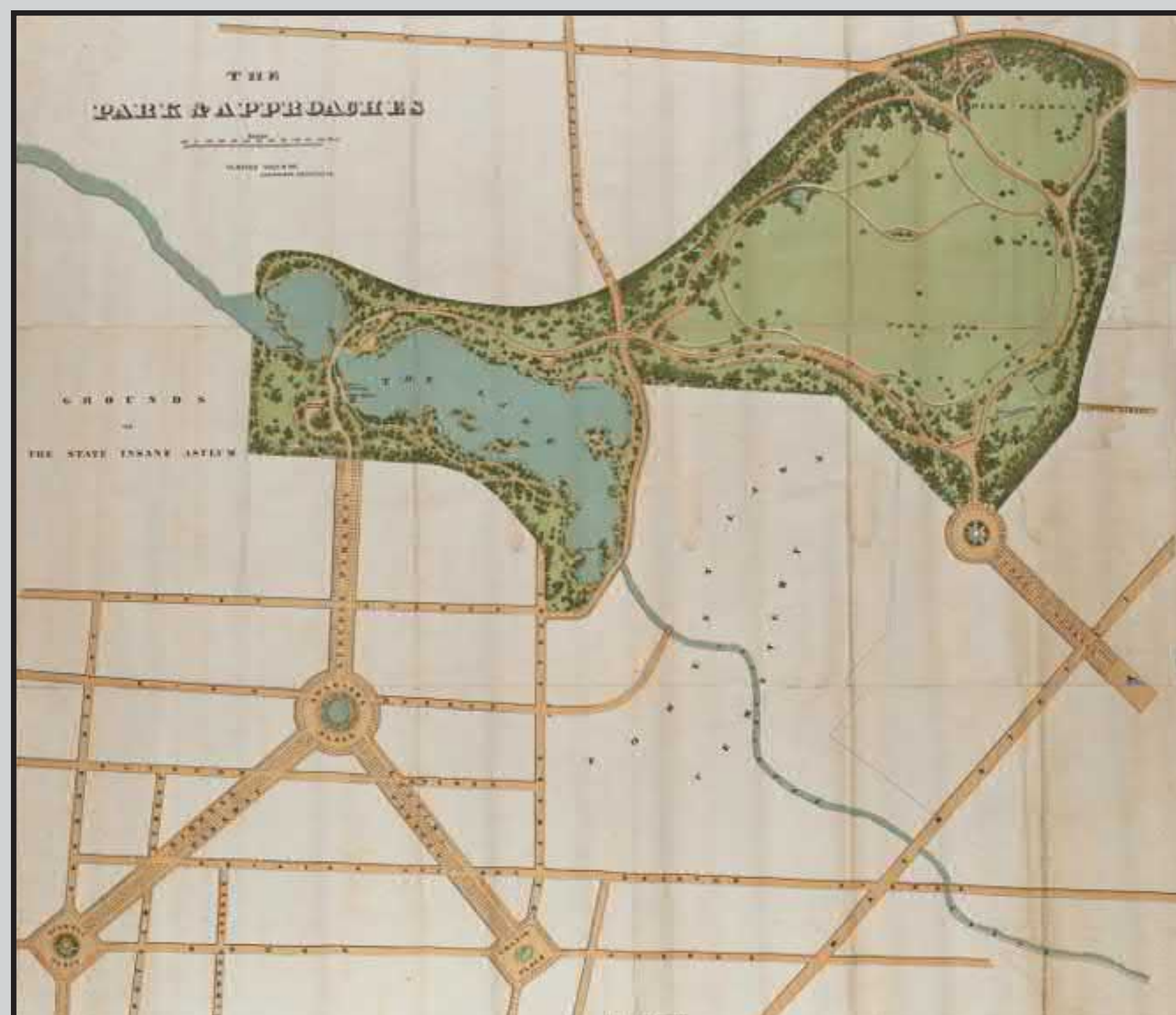
'The Park & Approaches', Buffalo NY, Olmsted Vaux & Co. 1865 - 1872

Frederick Law Olmsted Sr. and Calvert Vaux, the designers of the well-known Central Park in New York, first envisioned a park system tied together by 'Park Ways' while working in Buffalo NY in the late 1800's. See above.