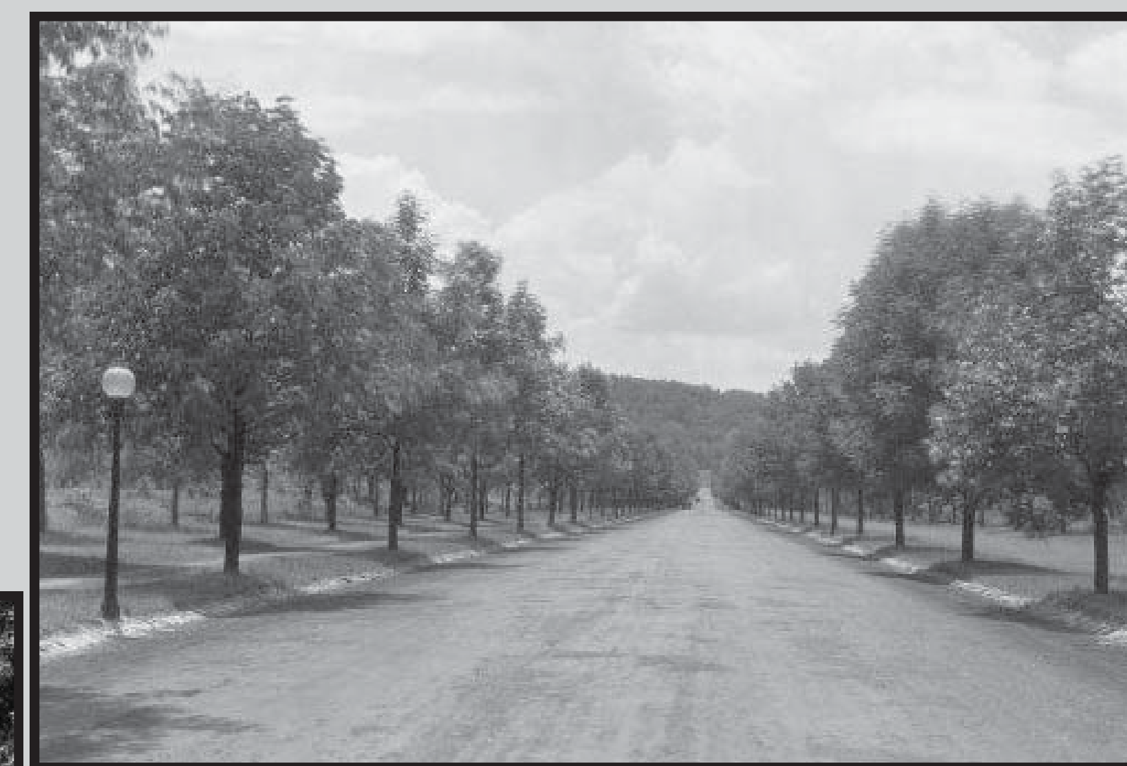
Southern Parkway, Louisville, 1921 looking southwest toward Iroquois Park